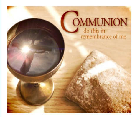
This Photo by Unknown Author is

We hope everyone can come and join in the fun!