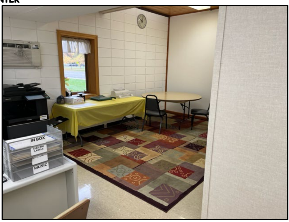
THE OTHER SIDE OF KATHY'S NEW OFFICE

Page | 7 Telephone: 989 793-0125 November, 2023