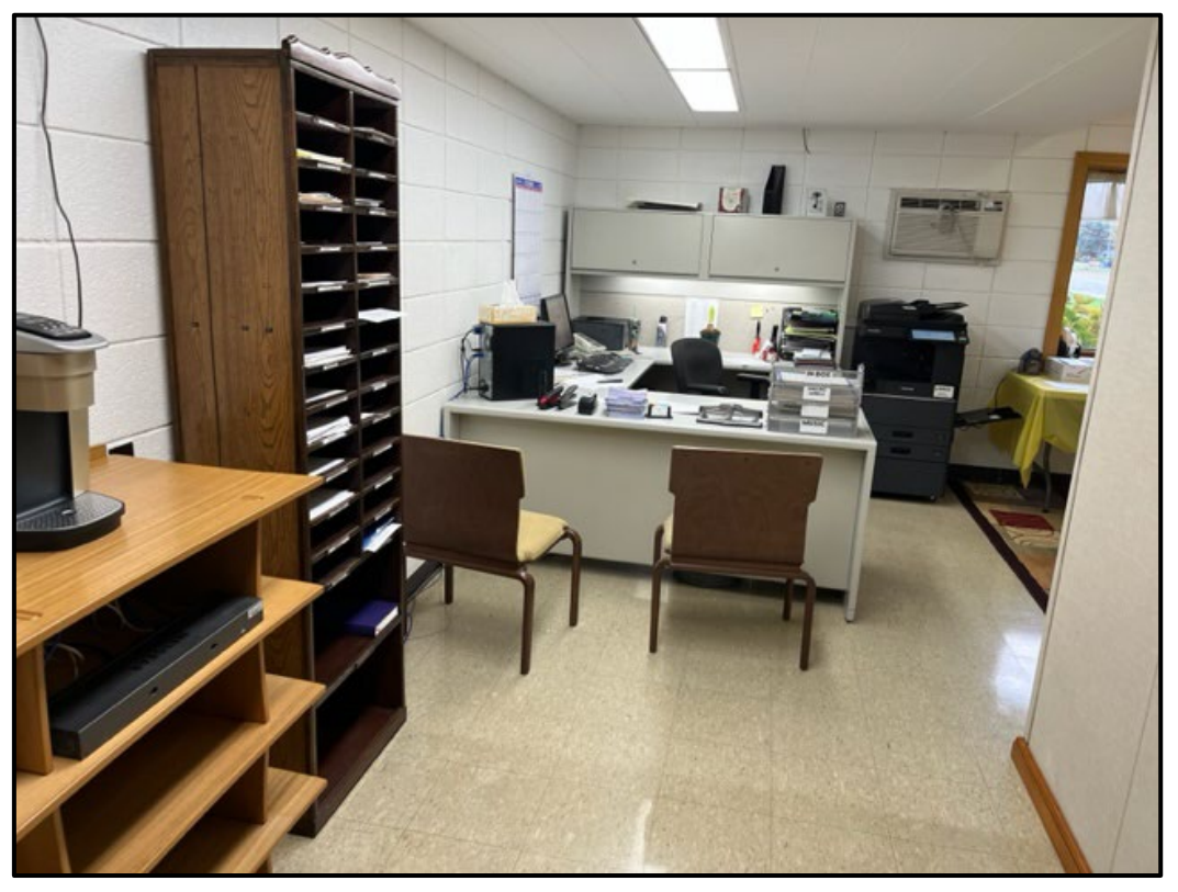
KATHY'S NEW OFFICE AS YOU ENTER